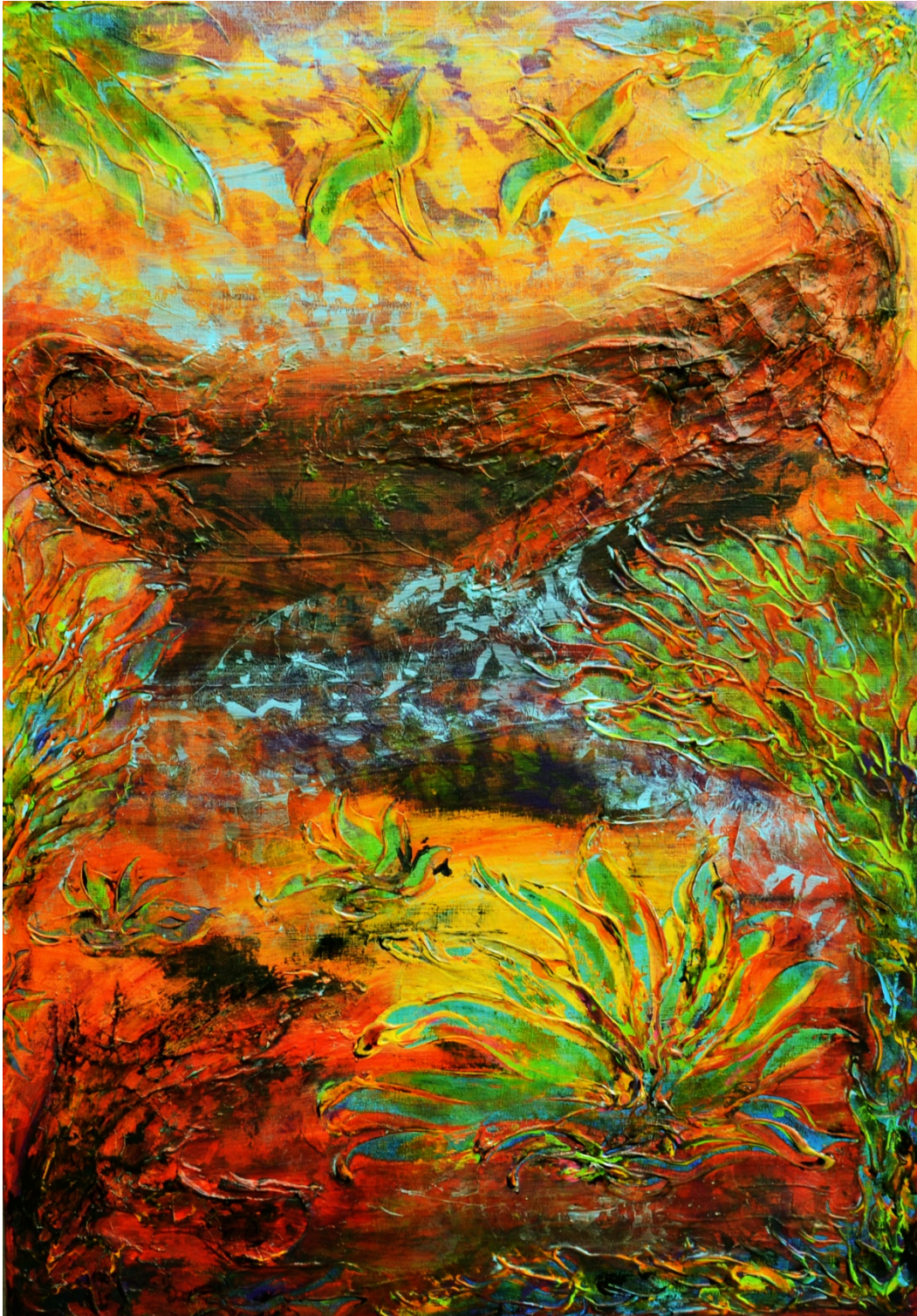
Desert flowers II